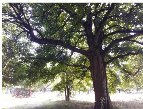
Grounds at Sudley Hall, Liverpool