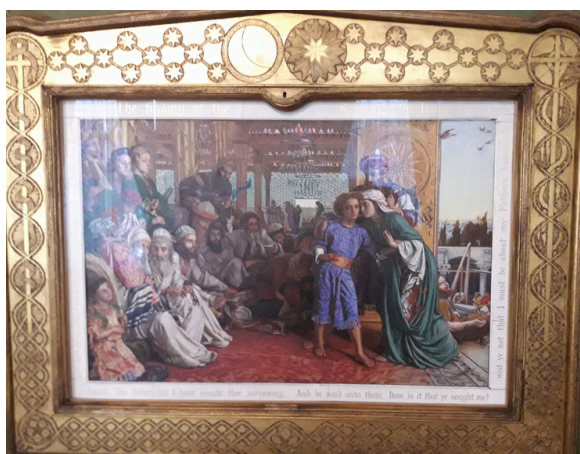
The Finding of the Saviour, Sudley House