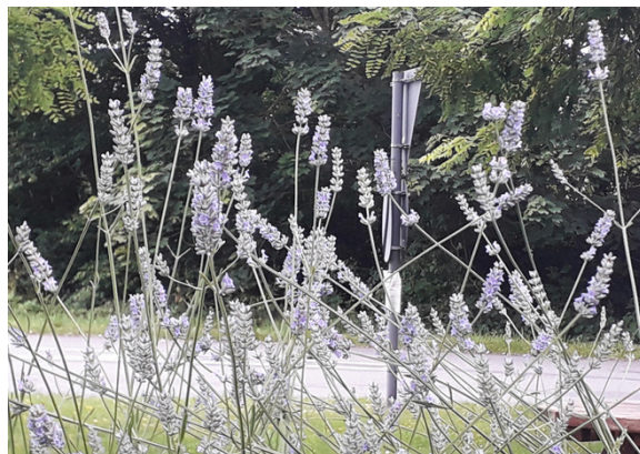
Lavender at The Blue Boar Inn