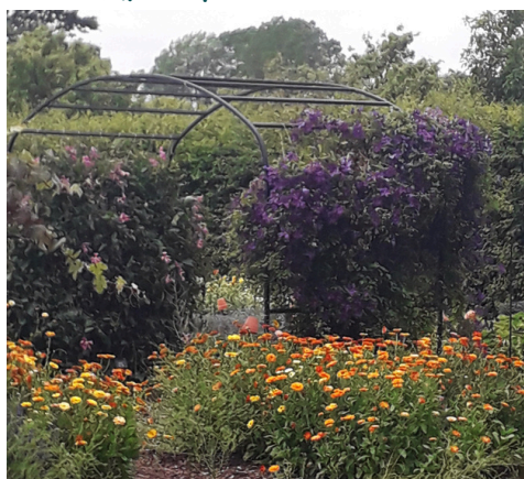
Walled garden at Coughton Hall, Alcester