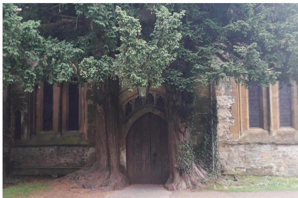
The yew Tree door at St Edward's, Alcester